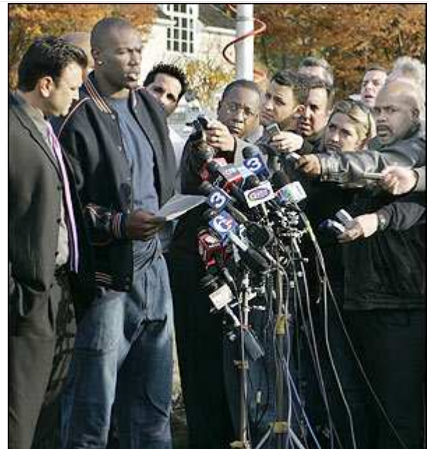
Terrell Owens and his agent Drew Rosenhaus (far left) addressed the media outside of Owens' house in Moorestown, N.J.

Asked to elaborate on how the team could be better off without its top receiver, McNabb emphasized the remaining players are united with the same goal of winning.